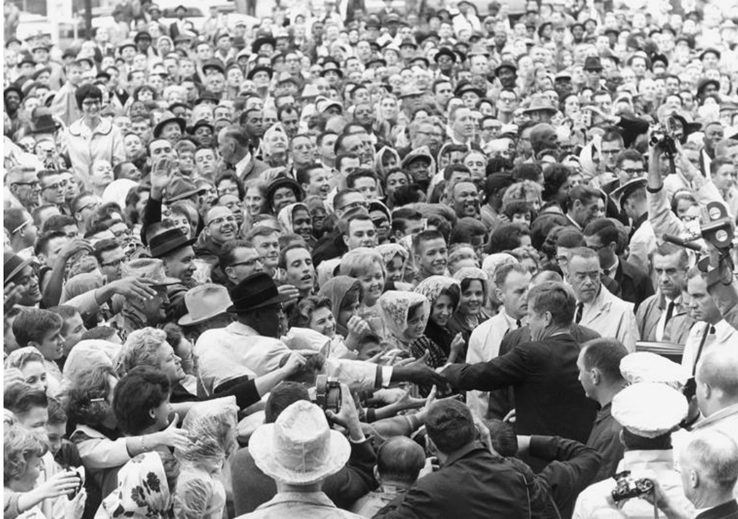
JFK at the "Parking Lot Rally" 22 Nov 1963, Fort Worth, Texas

In 1991 we started tracing our Fitzgerald family history back 1000 years to the end of the Desmond Fitzgerald rule in Ireland when they were defeated by the forces of Elizabeth I. History has marked the beginning of the British Empire with the end of the Desmond Wars following the beheading of the last Earl of Desmond in 1583. We identified the long history we were tracking as "Mystical Imperialism," a philosophy that rationalized the expansion of empire by infusing a sense of the divine into the raw politics of empire building. We will present our "Mystical Imperialism" research as powerful and invisible influences behind the framing of the assassination of JFK at the Dallas Convention this November 17, 2023. Conference and ZOOM link info can be accessed HERE .